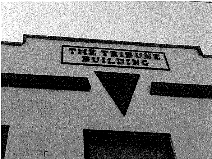
View of detail taken

Photography Neg. No (Roll No./Frame No.):