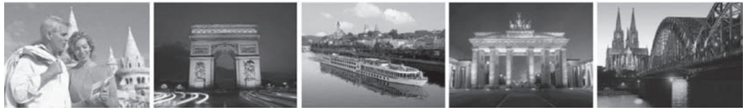
THE WORLD'S LEADING RIVER CRUISE LINE...BY FAR®